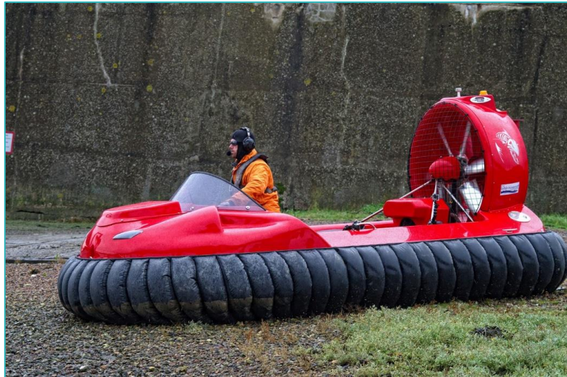
Figure 1: Coastal Transit Services Coastal-Pro MCAV Hovercraft