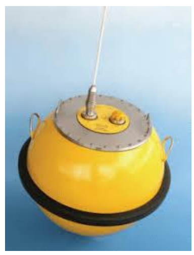
Figure 2: Wave buoy at site M6