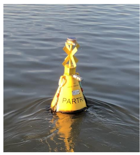
Figure 1: Guard Buoy at sites M1-M5

Kevin Ransom – Partrac Ltd. M: 07810 055685 E: kransom@partrac.com Port Flair Ltd., Bradwell Marina, Waterside Road, Bradwell-on-Sea, CM0 7RB. M: 01621 776235