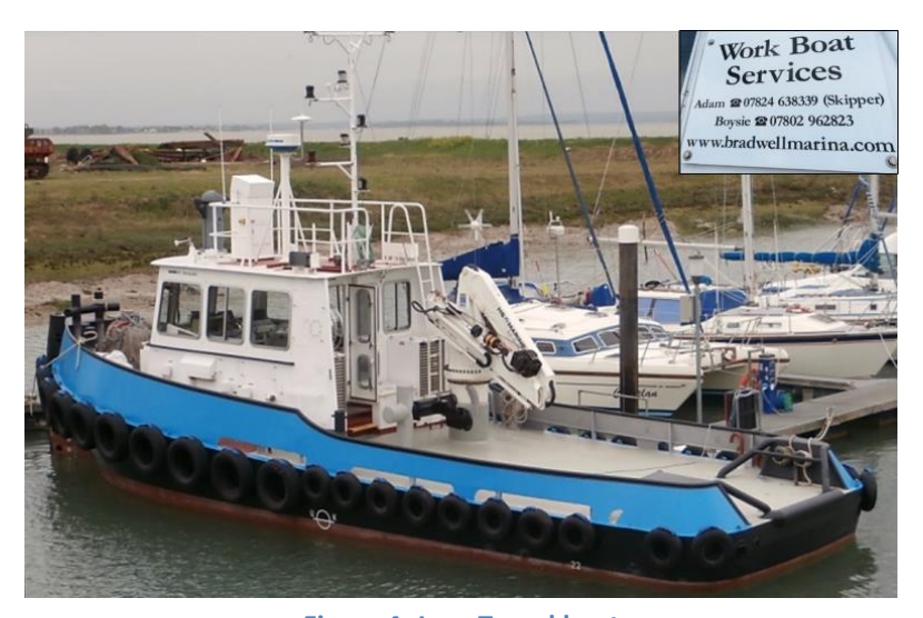
Figure 4: Jean T workboat