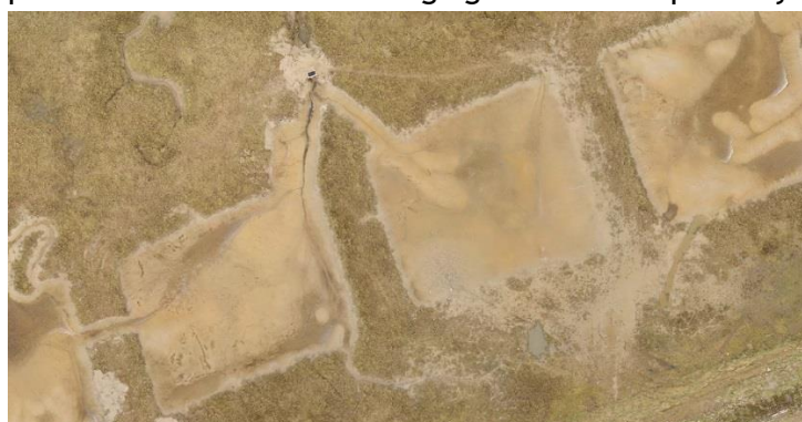
Figure 1, May 2017 before works

The USAR project as been an example (pilot) project that has put Brightlingsea on the map through the delivery of innovative methods and application of 'working with nature' and 'nature based solutions' believed to support the adaptation to climate change. Because of this Brightlingsea Harbour Commissioners have been commended by the Dutch 'Green Deal' and been named in relevant publications by PIANC and CEDA working groups. Work will continue on this exciting project, with a visit planned of the Thames Dredging Liaison Group in May.