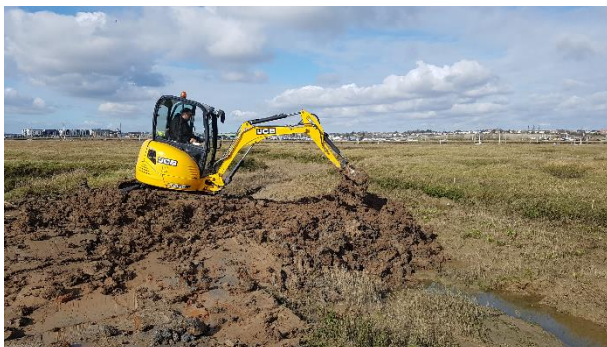
Figure 4, March 2020 repairs and additional works.