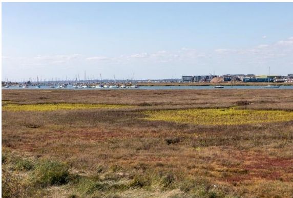
Figure 3, October 2019, colonisation with Samphire after one year.