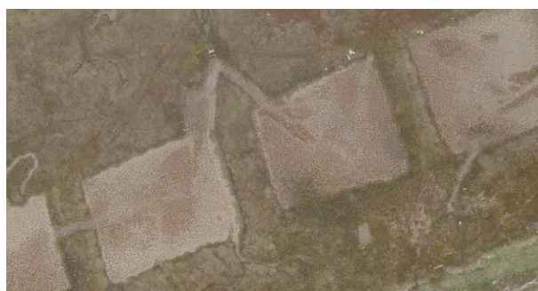
Figure 2, March 2018 after phase 1 works