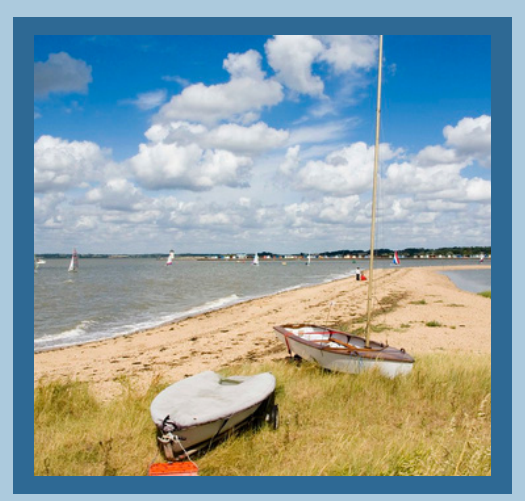
You can ramble along the sea wall to St Osyth Boatyard taking in the stunning views, the circular walk is approximately 5.13 miles, stopping for a bite to eat at T & Cake before your return journey

Three fantastic places to explore on foot! Brightlingsea Harbour runs a daily Foot Ferry service taking you to and from Brightlingsea, Point Clear and East Mersea. To book tickets & view Ferry times visit: www.brightlingseaharbour.org